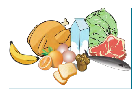
Omnivore - animal that gets all of its energy from eating meat and plants.