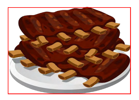
Carnivore - animal that gets most or all of its energy from eating meat.